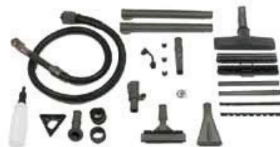
Standard equipments Steamer Jet