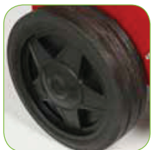
Large rear wheels for easy movement.