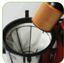
Equipped with standard cartridge fixed to the head.