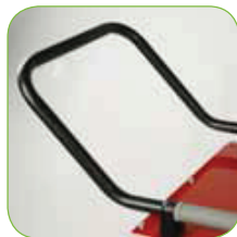
Equipped with handle for easy manoeuvring.